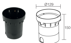
WC0601 Outer casing