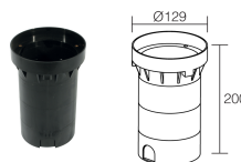
WC0701 Outer casing