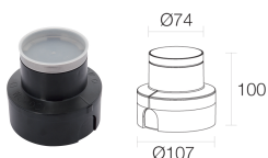
WC4020 Outer casing